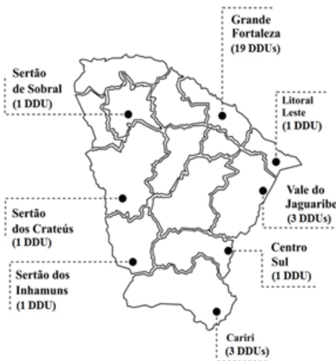
Figure 1. DDUs that are participating in the research according to Ceará macro-regions. Brazil, 2019.

This is a quantitative, descriptive, and exploratory study covering all 30 DDUs in Ceará, 13 of which are in Fortaleza, and the others distributed in 14 cities. The sampled units were registered from 2005 to January 2019 in the Logistic Control System of Medications ( Sistema de Controle Logístico de Medicamentos , SILCOM), the MS system responsible for managing ARV medications in Brazil. Figure 1 shows the territorial distribution of the DDUs in Ceará according to their respective macro-regions.